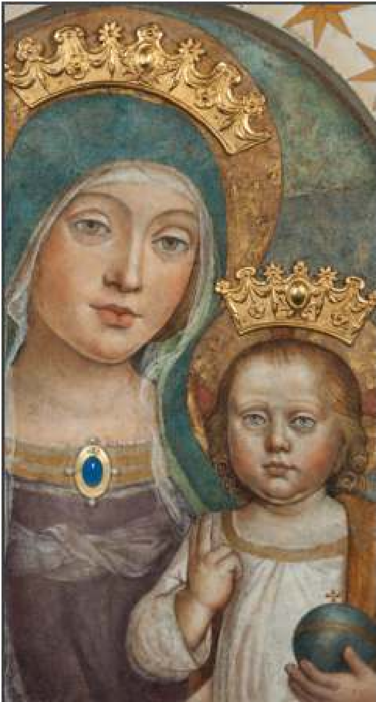
The ancient fresco of Madonna del Soccorso (Our Lady of Help) in St. Peter's Basilica was restored with the support of the Knights of Columbus to mark the Year of Faith (2012-2013).